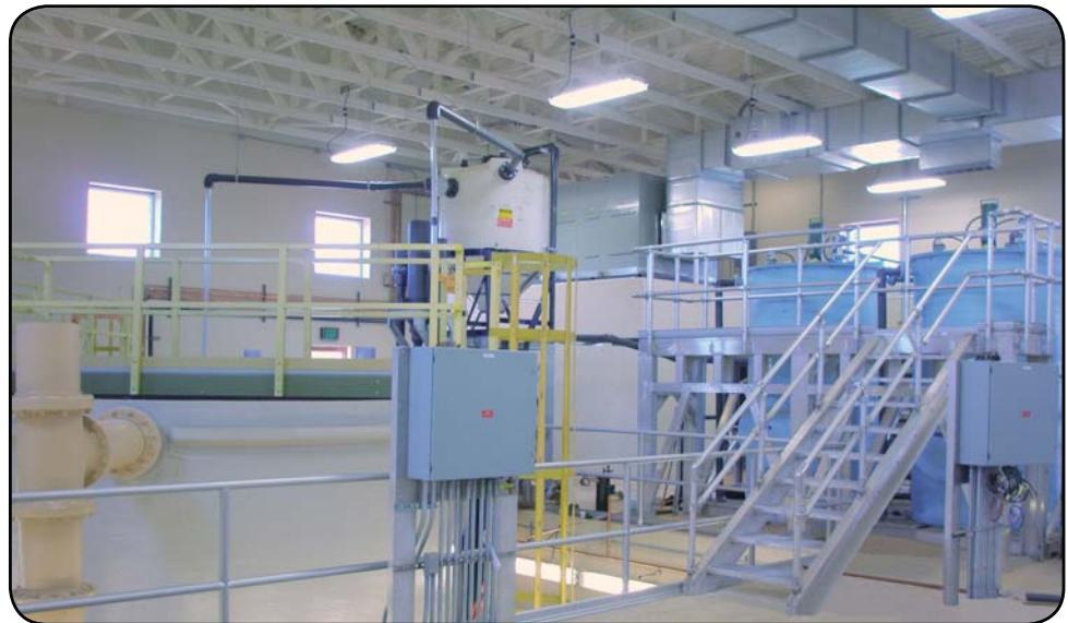
Figure 1: The MIEX® System at Oneonta, Alabama

“Our mission is to safely and reliably supply our customers with the highest quality solution at the lowest possible cost. Following a successful pilot trial in late 2008, we selected the MIEX® Process as the most cost-effective and sustainable option to meet the EPA Stage 2 DBP Rule.”